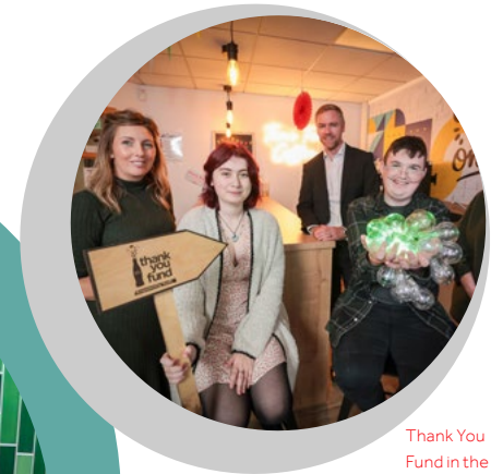
Thank You Fund in the island of Ireland

Around 60 employees and players from the Viennese Football Club cleaned the home district of SK Rapid in Austria.