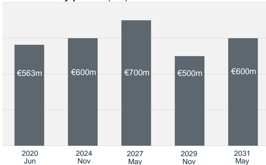
Debt maturity profile (€m)